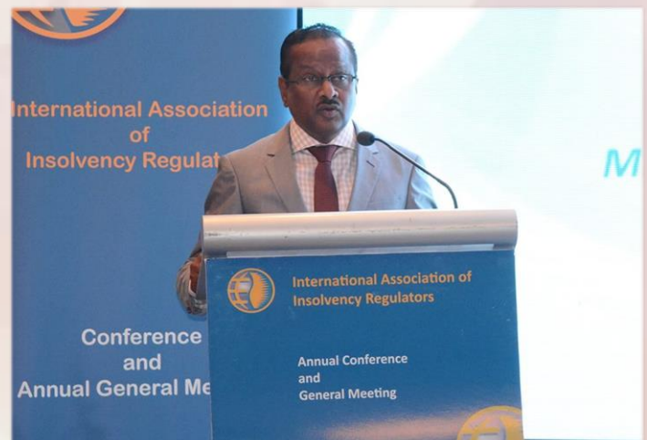
Hon. Minister delivered a keynote address last month at the Annual Conference of the International Association of Insolvency Regulators.