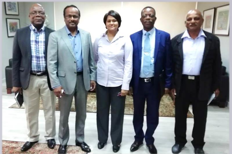
Meeting of ESAAMLG representatives with Minister Sesungkur and Ministry officials on MER rating.