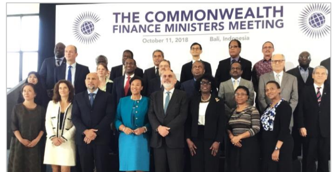
Delegates at the Commonwealth Finance Ministers meeting in Bali

According to a 2017 World Bank report, Mauritius is ranked 7 th amongst those countries which are most exposed to natural hazards and 13 th amongst those at risk of disasters. "SIDS worldwide not only have scarce financial means to recover