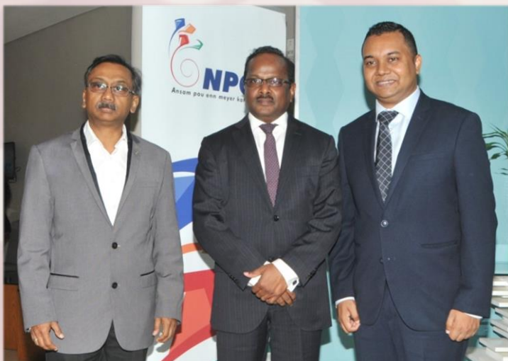
Minister Sesungkur launched the Training of Trainers program of the National Productivity and Competitiveness Council.

11-member delegation from the Republic of Ghana led by Hon. Yaw Osafo Maafo, Senior Minister. The latter was accompanied by Hon Dr Anthony Akoto Osei, Minister for Monitoring and Evaluation, Hon Stephen Asamoah Boateng, Minister for State Enterprise Commission and High Commissioner George Ayisi-Boateng. Both parties discussed mutual avenues of cooperation and investment in the financial services sector.