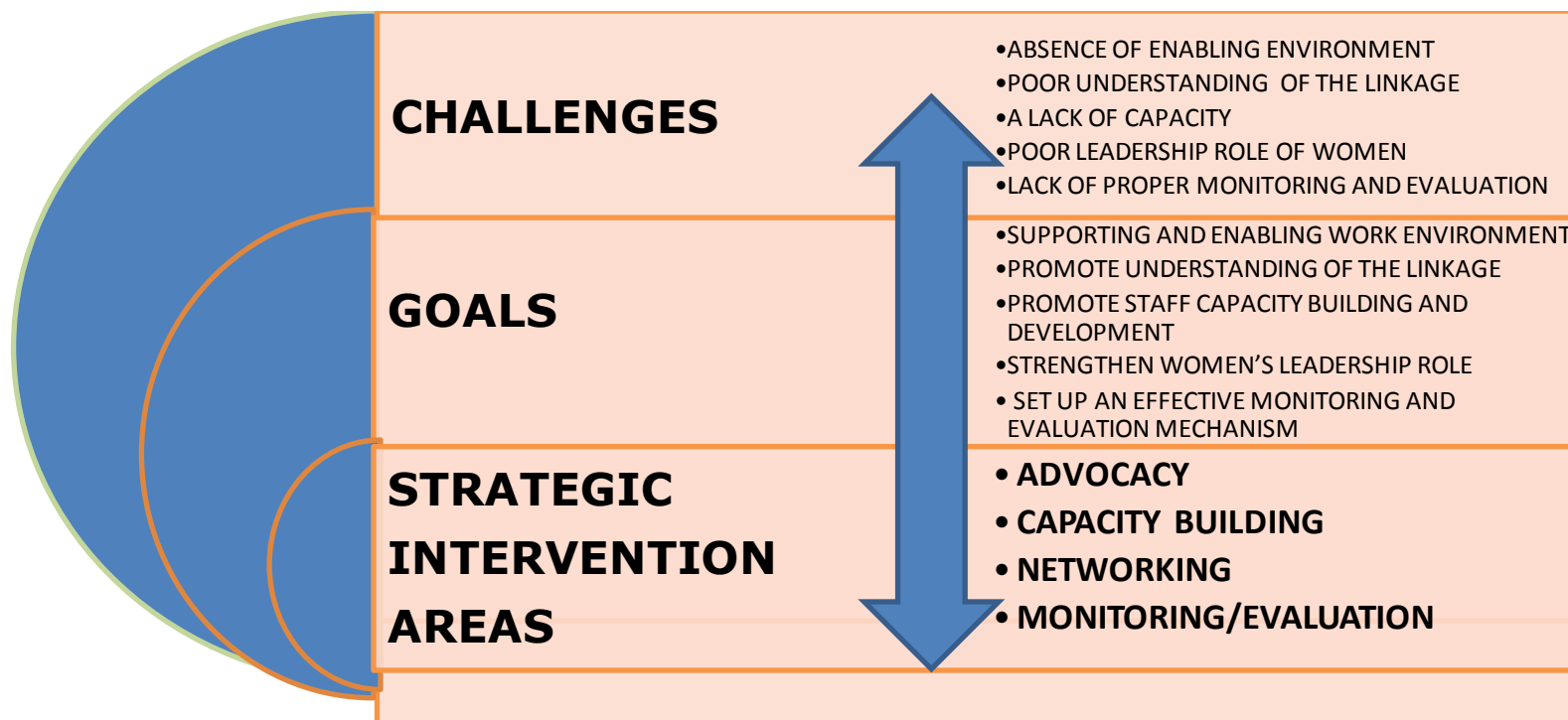
CHART 1: CHALLENGES, GOALS AND STRATEGIC INTERVENTION AREAS